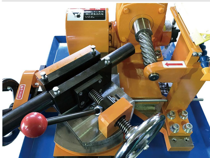
Angle Notching of MSD-60