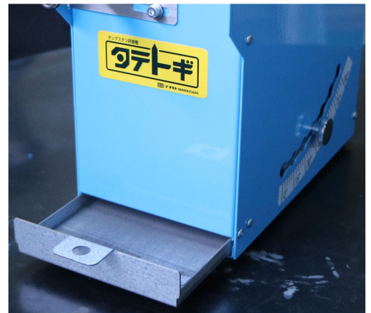
Dust Collecting Tray