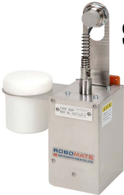
RNP-7 (Spring Type)