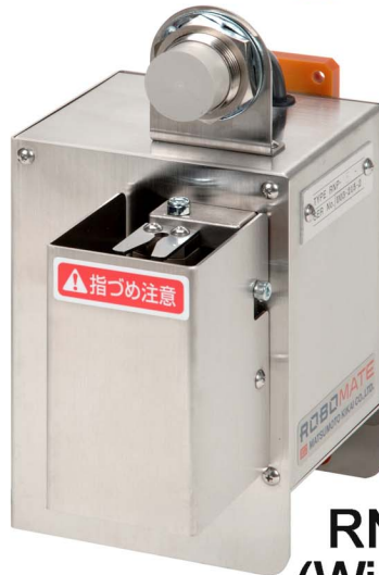
RNP-5-VC (Wire Cutting)